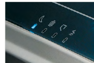
AUTOMATIC DISCONNECTION FROM THE MAIN POWER SUPPLY

It eliminates the need to manually lubricate the unit, protects the blades with anti-corrosive agents and ensures maximum reliability.