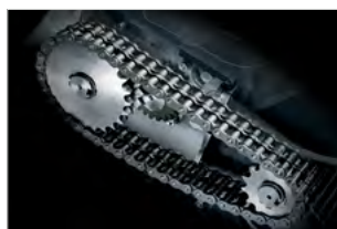
SUPER POTENTIAL POWER SYSTEM

Shows the shredding load required to optimize shredding without jams.