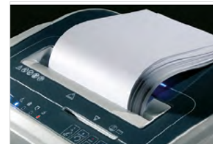
HIGH SHREDDING CAPACITY

Slide out tracks made it easy to empty the two waste collection bags.