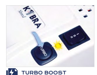
by pressing the Turbo switch the shredding capacity of the machine is

Heavy duty chain drive with steel gears which offer reliability and resistance to wear. Carbon hardened steel cutting knives unaffected by staples and clips.