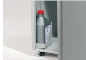
AUTOMATIC OILING SYSTEM

The lockable cover protects top-secrets or confidential documents waiting to be shredded when the shredder is left unattended. It is supplied with high security non-duplicable key.