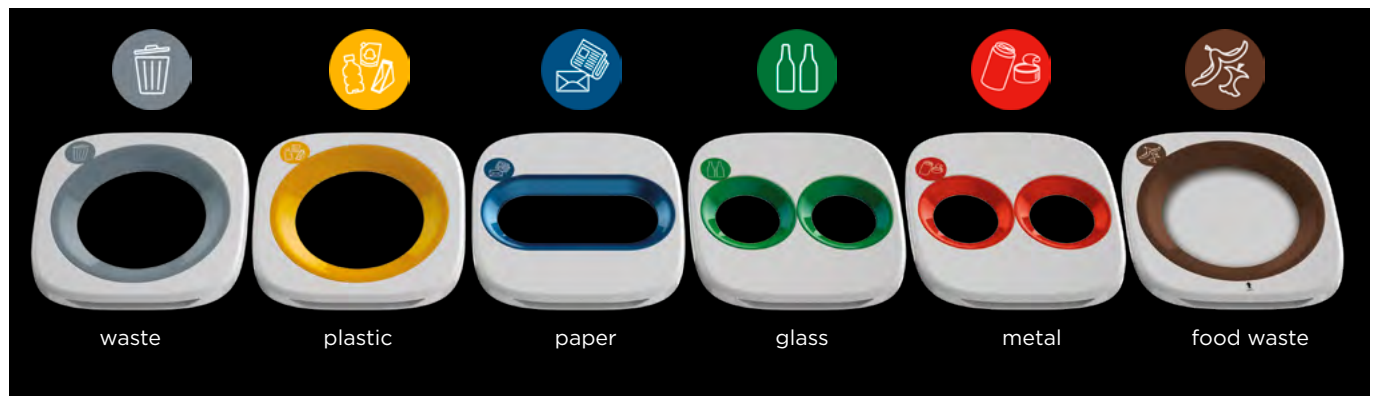
Graphics and colors help to separate types of waste.