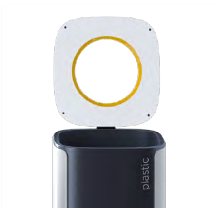
Quick and easy replacement of the bag.