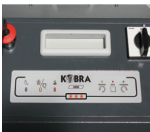
Convenient touch-screen panel with LED Feeding Control System.

Kobra HDD H4 can be supplied, on request, with the NSA National Security Agency approved Hard Disk degausser, model name MAGPRO 100.