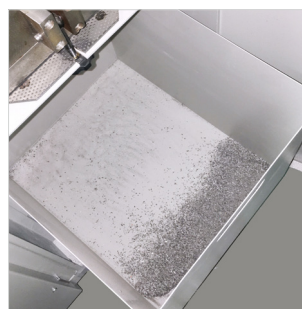
Easy removal and emptying of waste container