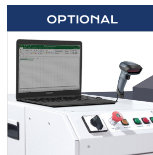
LOG MANAGEMENT SYSTEM: allows to scan and automatically store into a computer barcode serial number of the device being shredded, keeping track of day and hour (barcode reader included).