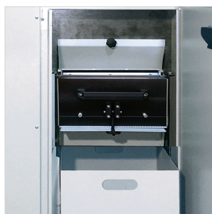
Easy access to cutting unit and waste container, easy for maintenance or service.