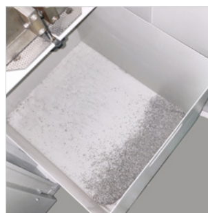
Easy removal and emptying of waste container.