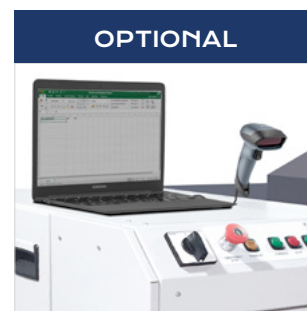
LOG MANAGEMENT SYSTEM: allows to scan and automatically store into a computer barcode serial number of the device being shredded, keeping track of day and hour (barcode reader included) to certify the shredding of any data holder to prove compliance to the regulations in case of inspection.