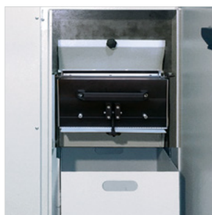
Easy access to cutting unit and waste container, easy for maintenance or service.