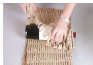
FILLING MATERIAL FROM CORRUGATED CARDBOARD for safe deliveries of any product.