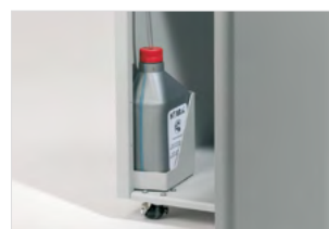
INTEGRATED AUTOMATIC OILING SYSTEM

Heavy duty chain drive with steel gears which offer reliability and resistance to wear.