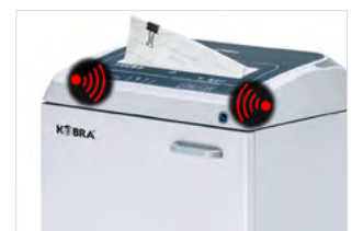
METAL DETECTION SYSTEM SHRED GUARD

The Shred Guard System stops the machine when large metal objects are accidentally inserted. An illuminated optical indicator warns the operator to remove these objects in order to protect the knives.