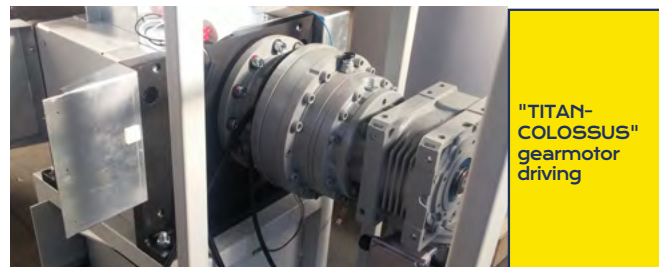
The Kobra HDD is equipped with the "Titan-Colossus" gearmotor driving specially designed heavy duty cutting knives with unmatched power to shred large quantities of rotational and digital media devices, including: Hard Disk Drives up to 3.5", Solid State Drives (SSD), LTO, Ultrium magnetic tapes, CDs, DVDs, Blu-ray Optical Media, Credit and Identity Cards, USB Sticks and Solid State Devices (Phones and PDAs).