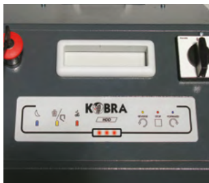
Convenient touch-screen panel with LED Feeding Control System.

Kobra HDD H4 can be supplied, on request, with the NSA National Security Agency approved Hard Disk degausser, model name MAGPRO 100.