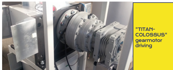
The Kobra HDD H4 is equipped with the "Titan-Colossus" gearmotor driving specially designed heavy duty cutting knives with unmatched power to shred large quantities of rotational and digital media devices, including: Hard Disk Drives up to 3.5", Solid State Drives (SSD), LTO, Ultrium magnetic tapes and Solid State Devices (Phones and PDAs).