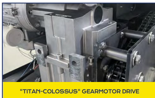
"TITAN-COLOSSUS" GEARMOTOR DRIVE

Touch-screen operating panel: controls are activated by simply touching the intuitive control panel with LED indicators.