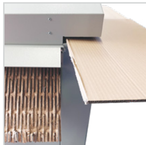
ADJUSTABLE WORKING WIDTH: automatically cuts carton of larger size than entry throat.