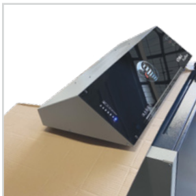
REMARKABLE TOUCH SCREEN PANEL