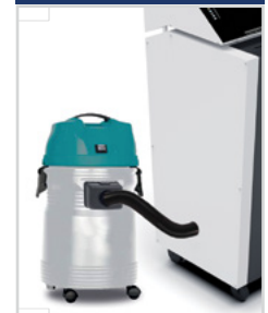
DCS-500 COMPLETE DUST COLLECTION SYSTEM to provide dust free padding mats.