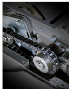
SUPER POTENTIAL POWER SYSTEM: chain drive system with steel gears.