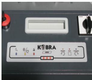
Convenient touch-screen panel with LED Feeding Control System.

Kobra HDD can be supplied, on request, with the NSA National Security Agency approved Hard Disk degausser, model name MAGPRO 100.