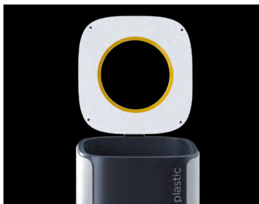
Quick and easy replacement of the bag.