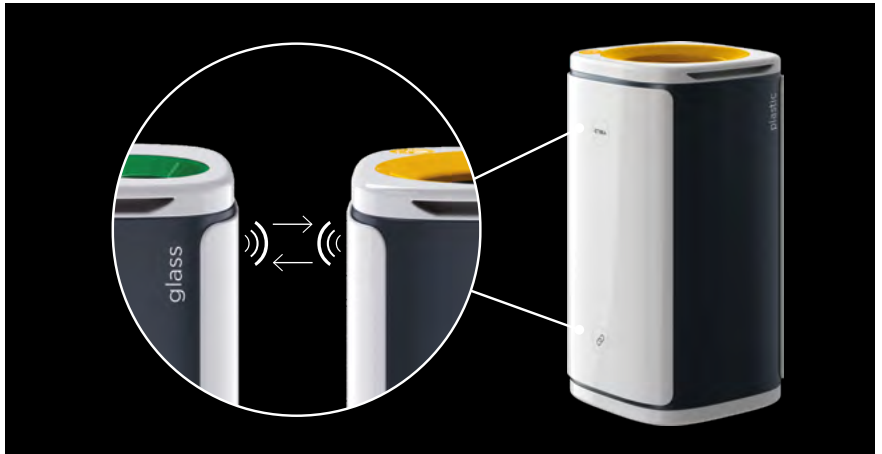
Two round areas located on each side include a magnet for easy joining of more bins to each other.