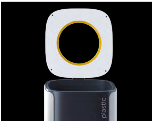
Quick and easy replacement of the bag.