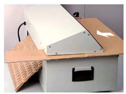
Easy to use, adjustable working width. Automatically cuts carton of larger size than entry throat.