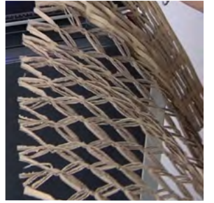
Flexible high quality packing material from corrugated cardboards.