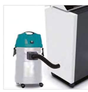
OPTION: Kobra DCS-500 complete dust collection system including vacuum motor.