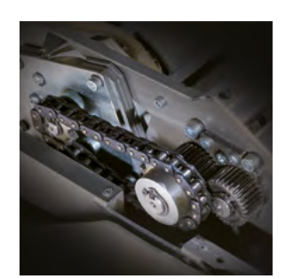
Chain drive with steel gears.