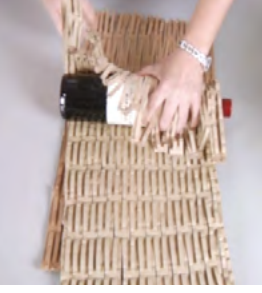
Pack and protect your objects in the best, safest and cheapest way.