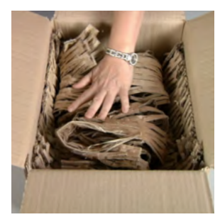
Pack and protect your objects in the best, safest and cheapest way.