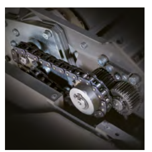
Chain drive with steel gears.