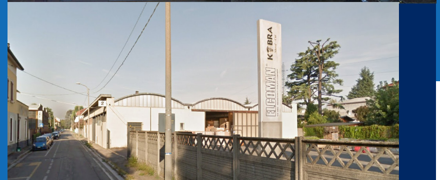
Headquarters and production sites are located at Bovisio Masciago (20 Km north of Milan)