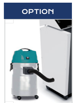
DCS-500 COMPLETE DUST COLLECTION SYSTEM to provide dust free padding mats.