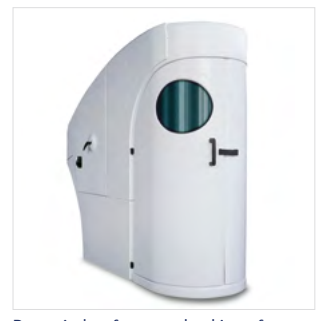
Rear window for easy checking of waste bag level