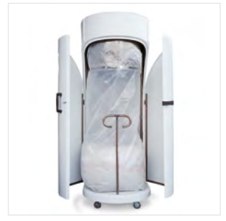
Kobra Cyclone (standard version) utilizes a 400 litre plastic waste bag. Full bags are easily removed and disposed of assisted by the built-in-trolley.