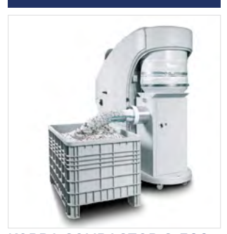
KOBRA COMPACTOR C-500 reduces by 4-5 times the volume of the shredded paper. Shredded and compacted paper can be collected into any type of container or into plastic waste bags. Compacting paper increases security of one level (ISO/IEC 21964).