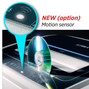
TWO SEPARATE SETS OF CUTTING KNIVES

Shows the shredding load required to optimize shredding without jams.