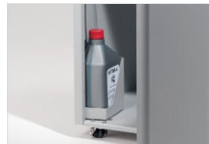
AUTOMATIC OILING SYSTEM

The Automatic Oiler eliminates the need to manually lubricate the unit. Not only does this protect the blades with anti-corrosive agents, but ensures maximum reliability, efficiency and capacity.