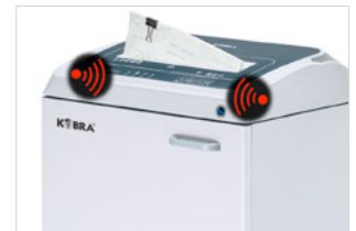
METAL DETECTION SYSTEM SHRED GUARD

The Automatic Oiler eliminates the need to manually lubricate the unit. Not only does this protect the blades with anti-corrosive agents, but ensures maximum reliability, efficiency and capacity.