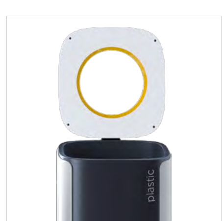
Quick and easy replacement of the bag.