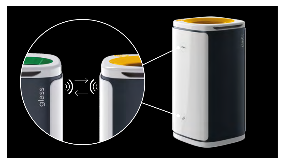
Two round areas located on each side include a magnet for easy joining of more bins to each other.