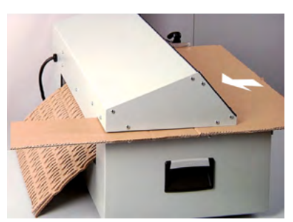
Easy to use, adjustable working width. Automatically cuts carton of larger size than entry throat.