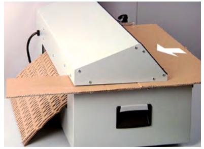
Easy to use, adjustable working width. Automatically cuts carton of larger size than entry throat.