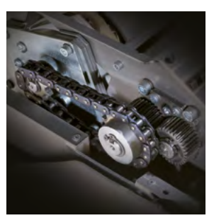
Chain drive with steel gears.