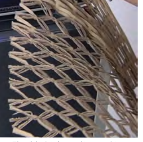
Flexible high quality packing material from corrugated cardboards.