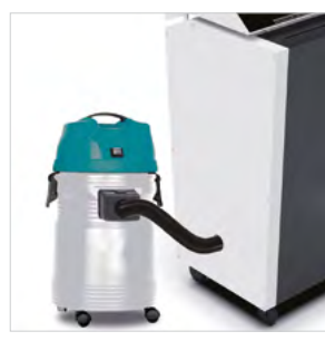
OPTION: Kobra DCS-500 complete dust collection system including vacuum motor.