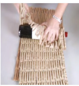
Pack and protect your objects in the best, safest and cheapest way.