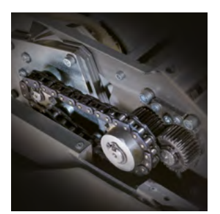
Chain drive with steel gears.