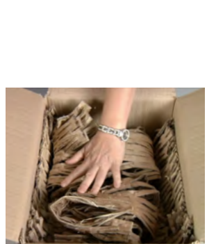
Pack and protect your objects in the best, safest and cheapest way.